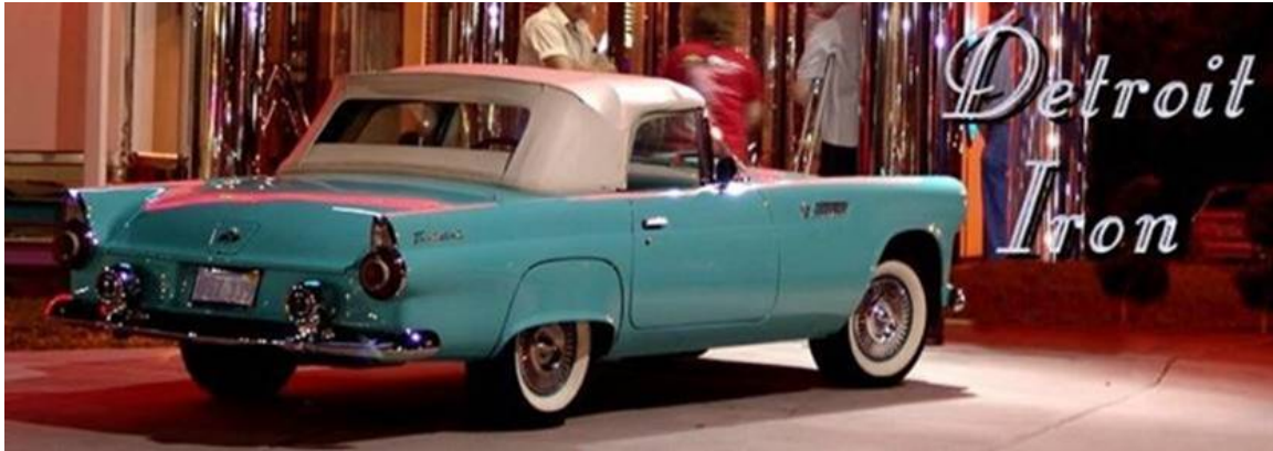
1956 Ford Thunderbird