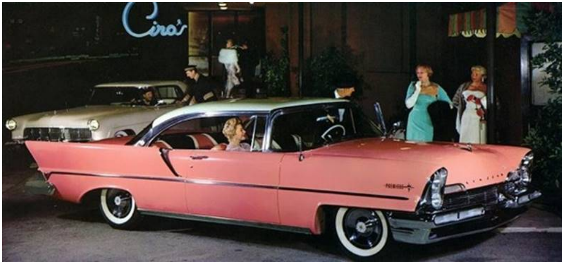
1957 Lincoln Premiere