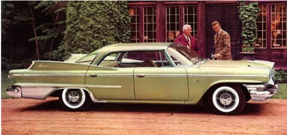
1960 Dodge Polara Matador