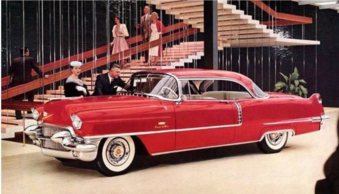
1956 Cadillac Series 62 Coupe de Ville