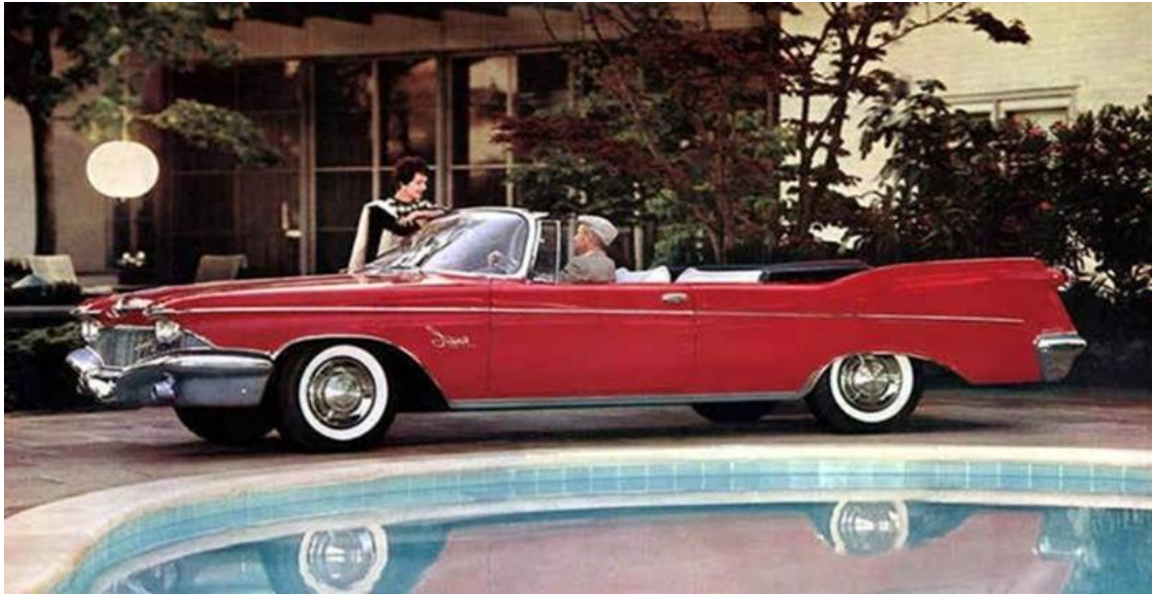
1960 Imperial Crown Convertible