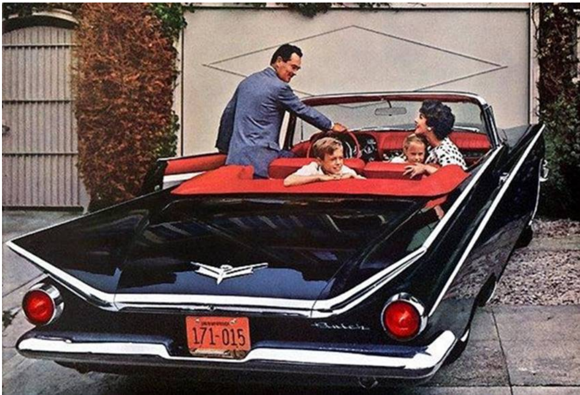
1959 Buick 2 Door Convertible