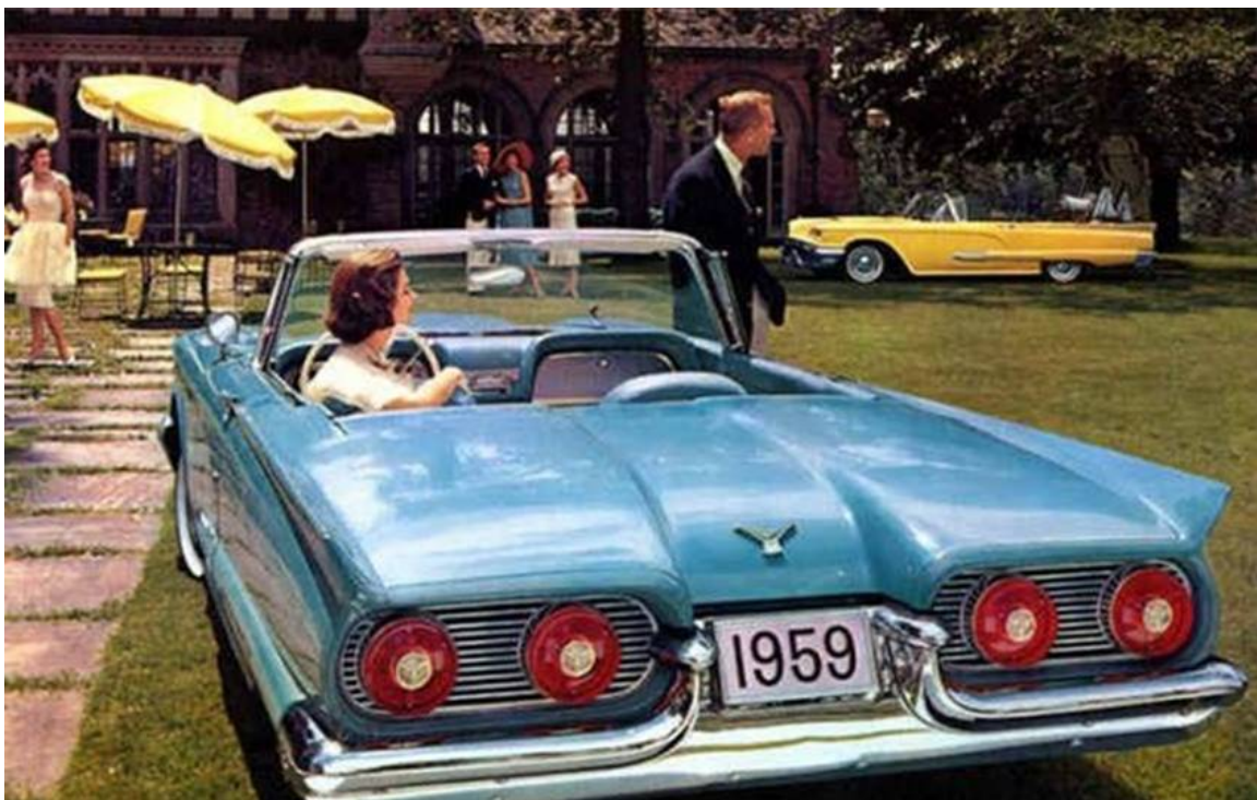
1959 Ford Thunderbird Convertible