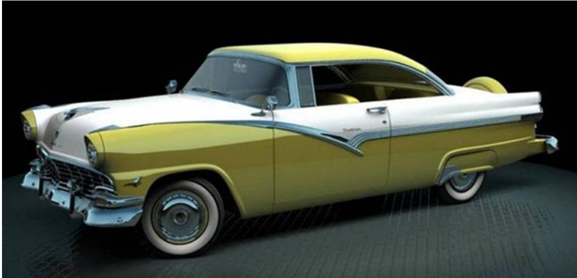
1956 Ford Fairlane Victoria