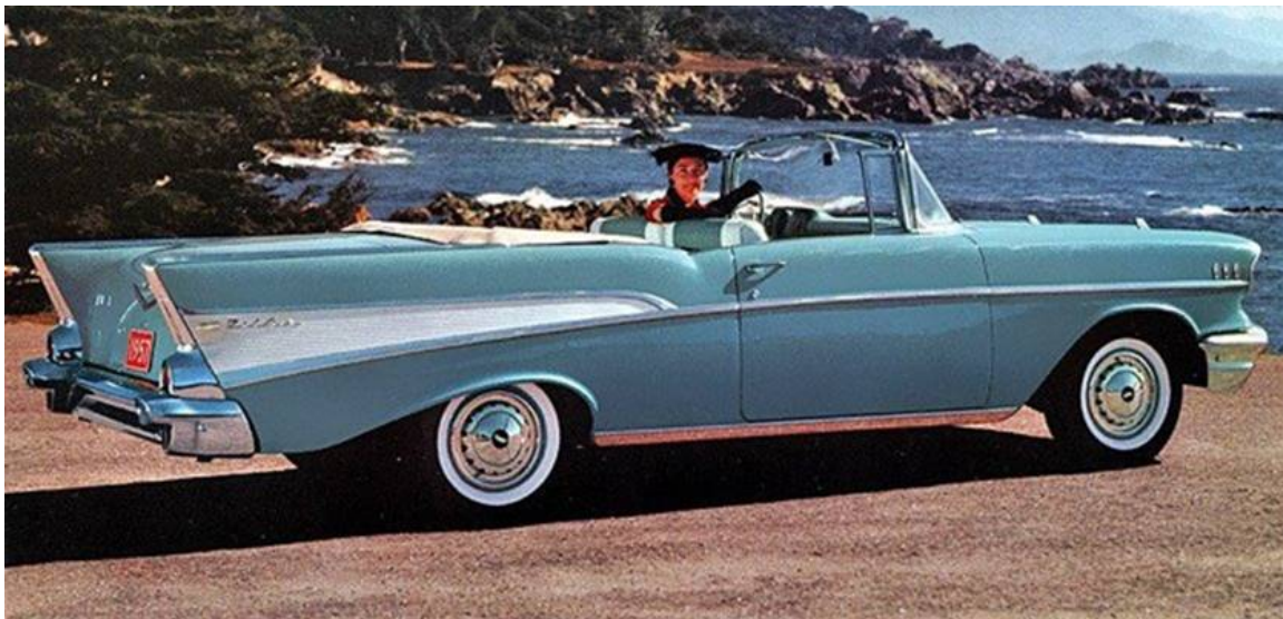
1957 Chevrolet Bel Air Convertible