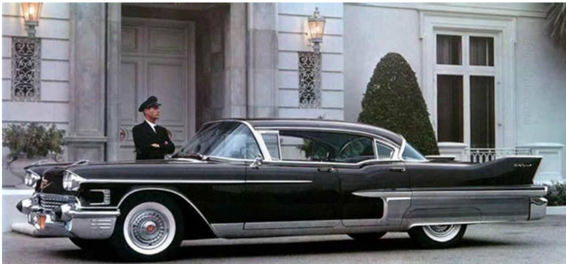
1958 Cadillac Fleetwood Sixty Special