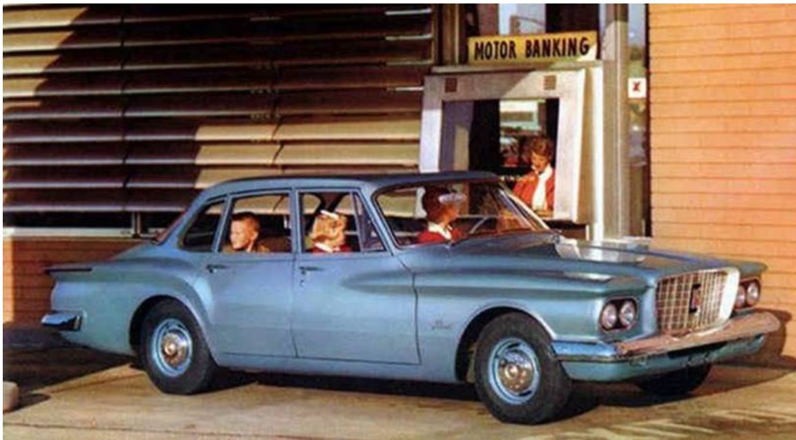
1960 Chrysler Valiant