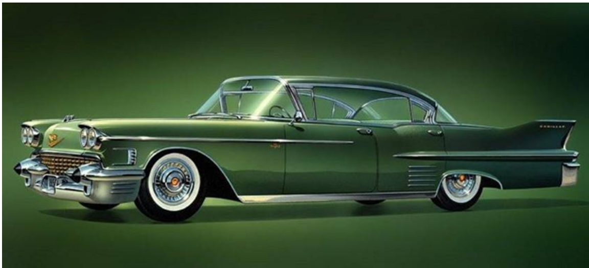
1958 Cadillac Series 62 Sedan