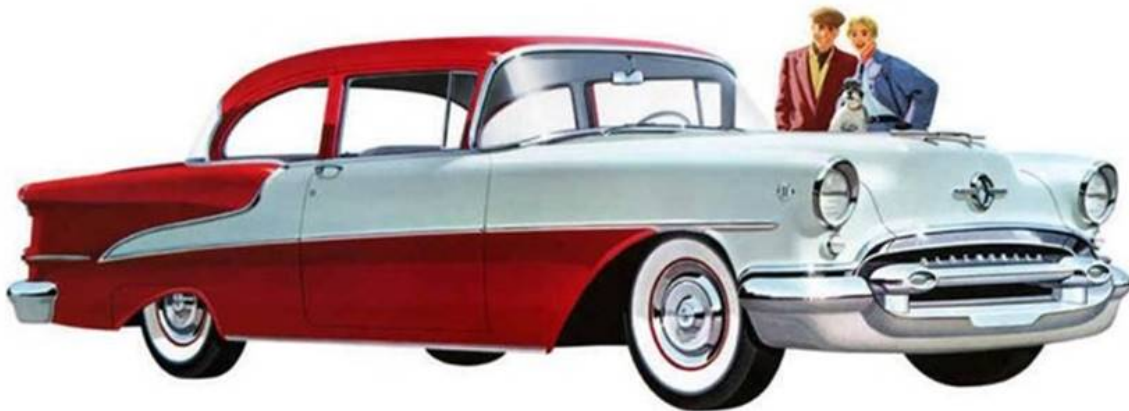
1955 Oldsmobile Super 88 Two-Door Sedan