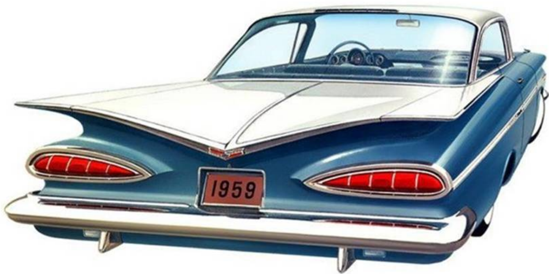
1959 Chevrolet Impala 2Dr hardtop