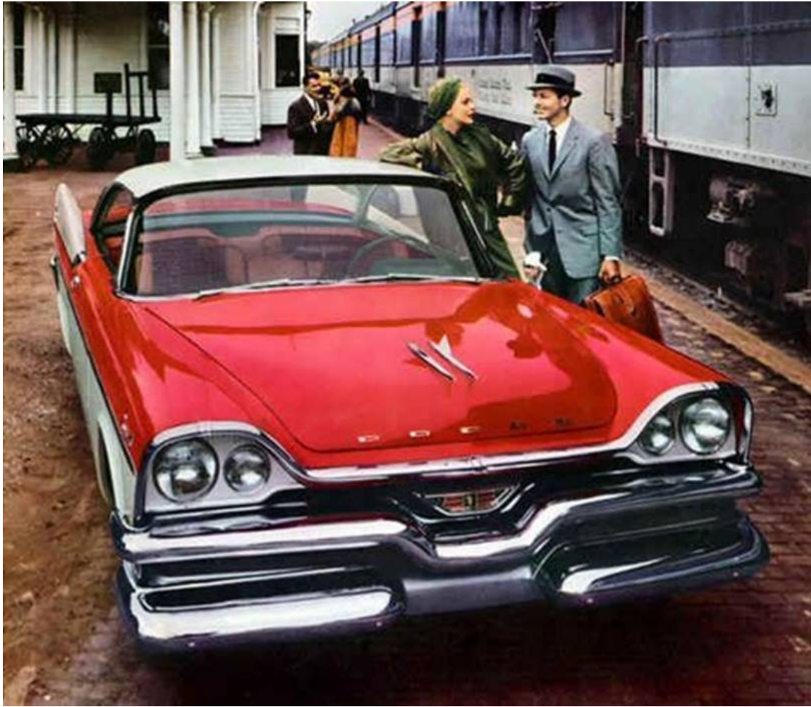
1957 Dodge Royal Lancer