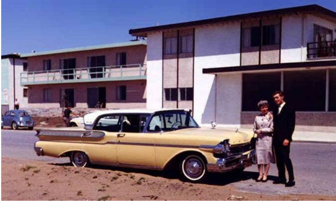
1957 Mercury Turnpike Cruiser