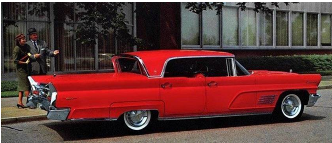
1960 Lincoln Continental Mark V Four Door Landau