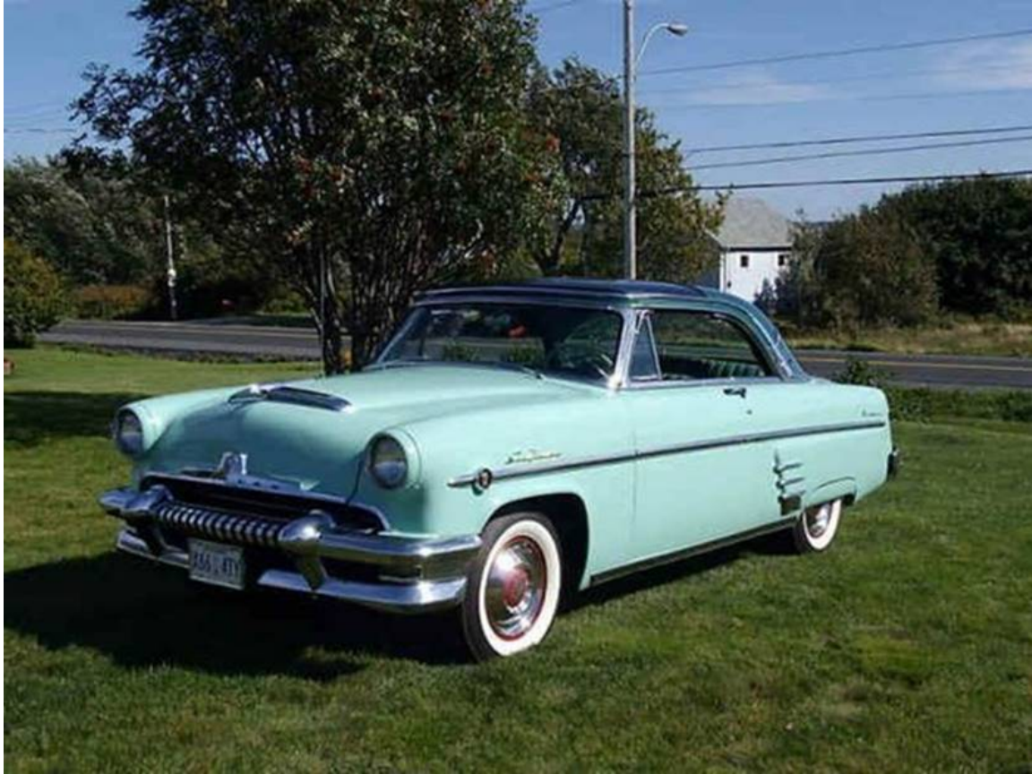
1954 Mercury Sun Valley