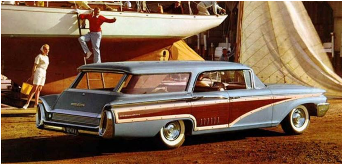
1960 Mercury Colony Park Country Cruiser