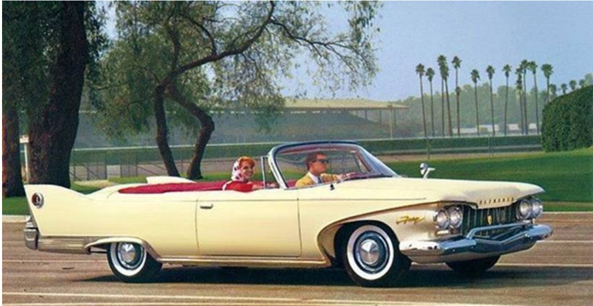
1960 Plymouth Fury