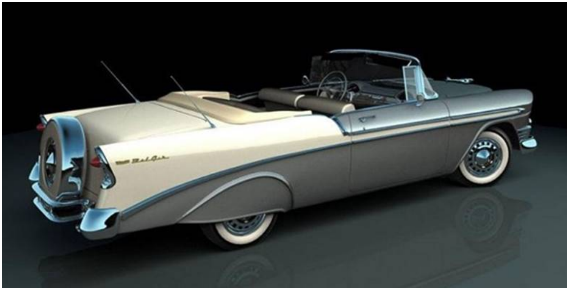
1956 Chevrolet Bel Air Convertible

What a trip down memory lane... Be sure to share with all your old friends!