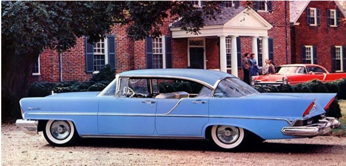
1957 Lincoln Premiere four-door Landau