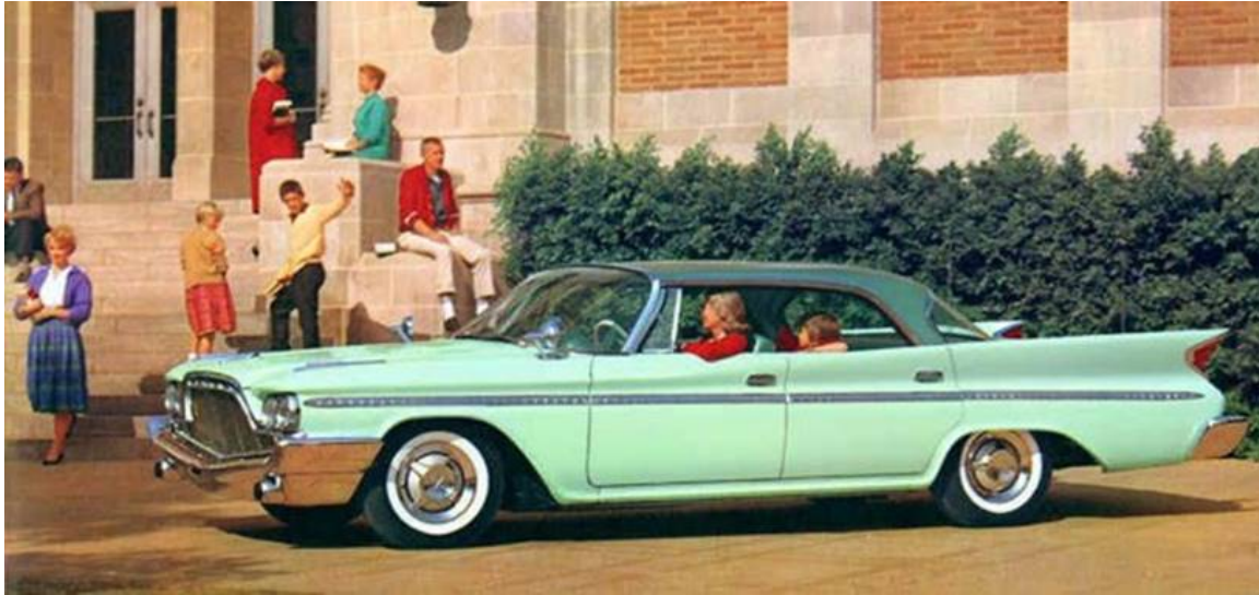
1960 De Soto Fireflite