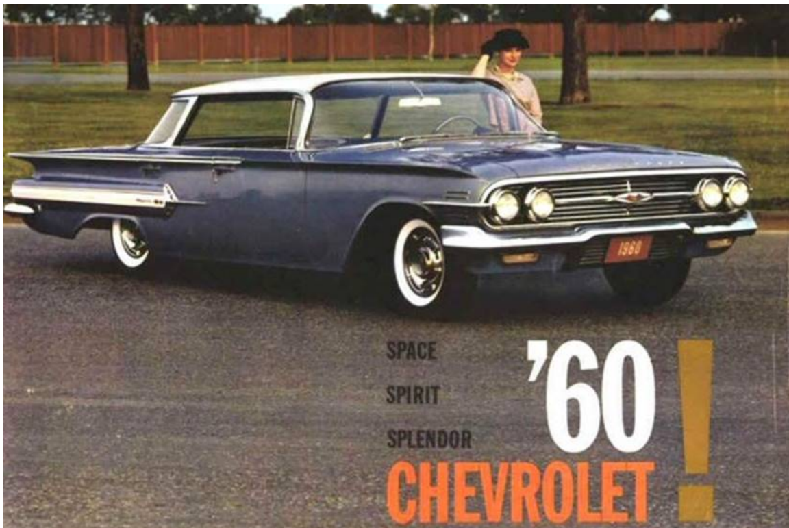
1960 Chevrolet Impala Four Door Hardtop