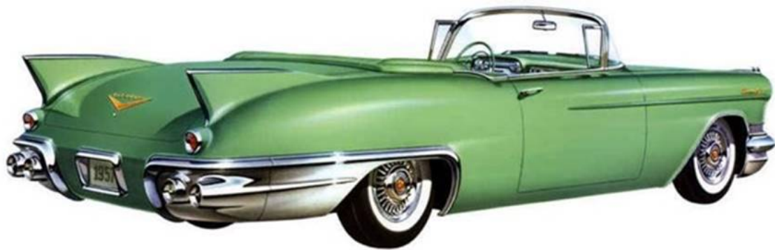
1957 Cadillac Eldorado Biarritz