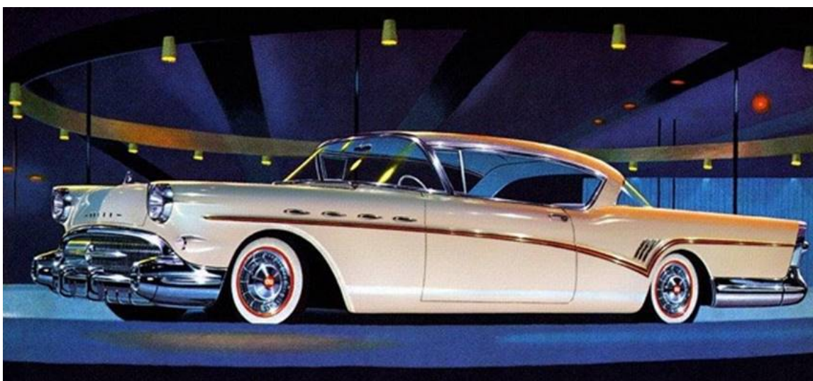
1957 Buick Roadmaster 2 Door Hardtop