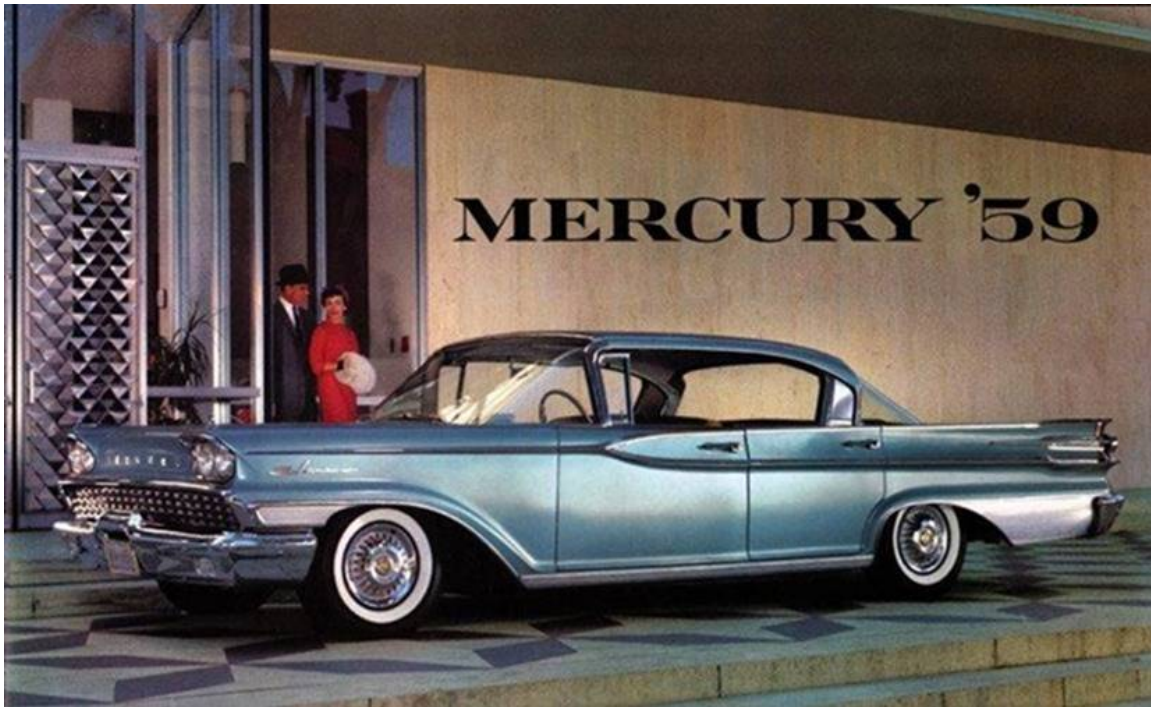
1959 Mercury Four Door Hardtop