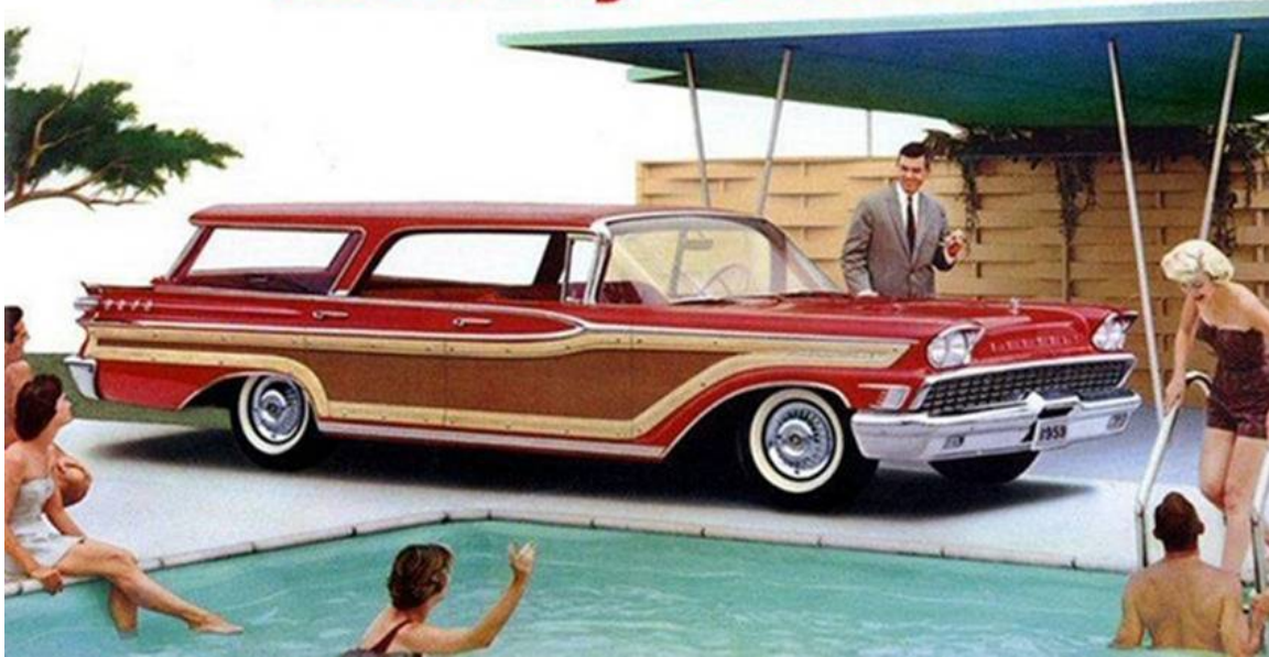
1959 Mercury Colony Park Country Cruiser