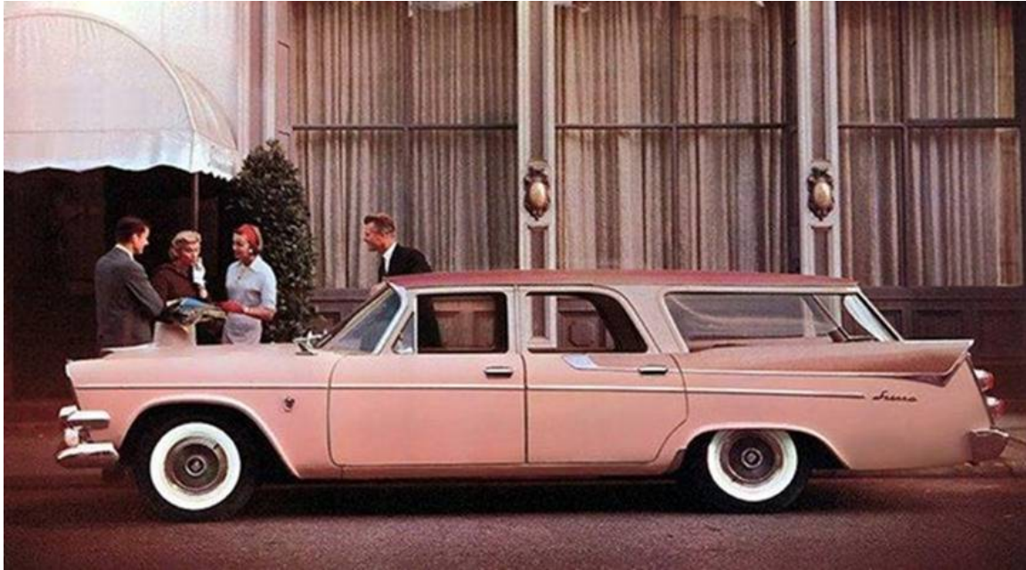
1958 Dodge Custom Sierra