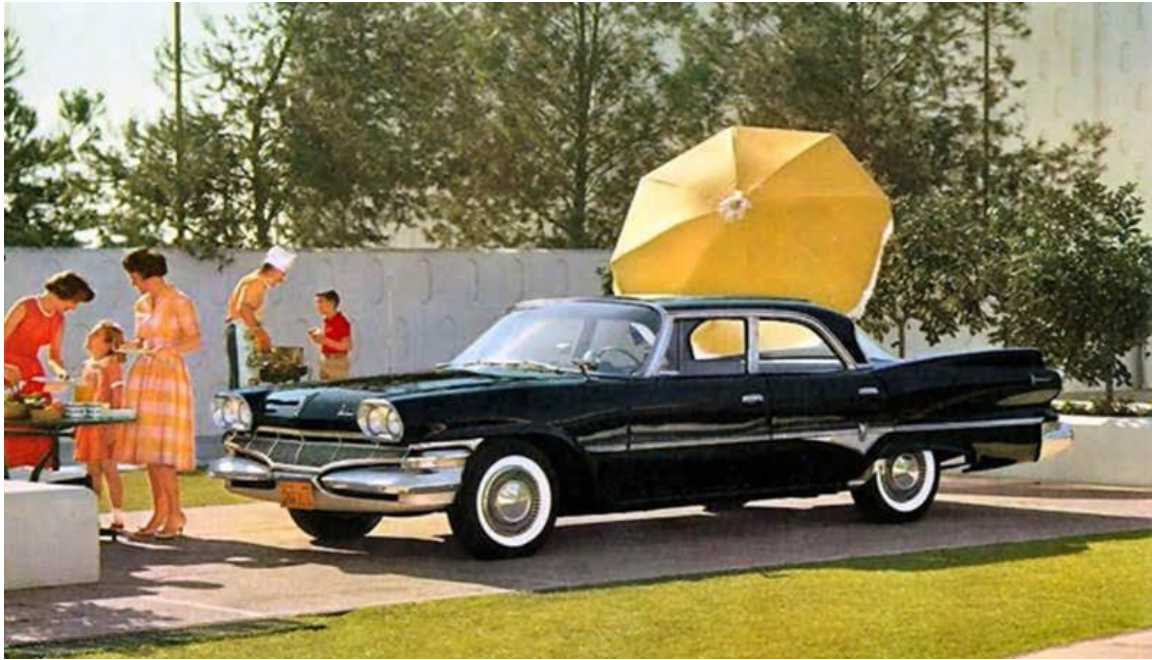
1960 Dodge Dart Pioneer