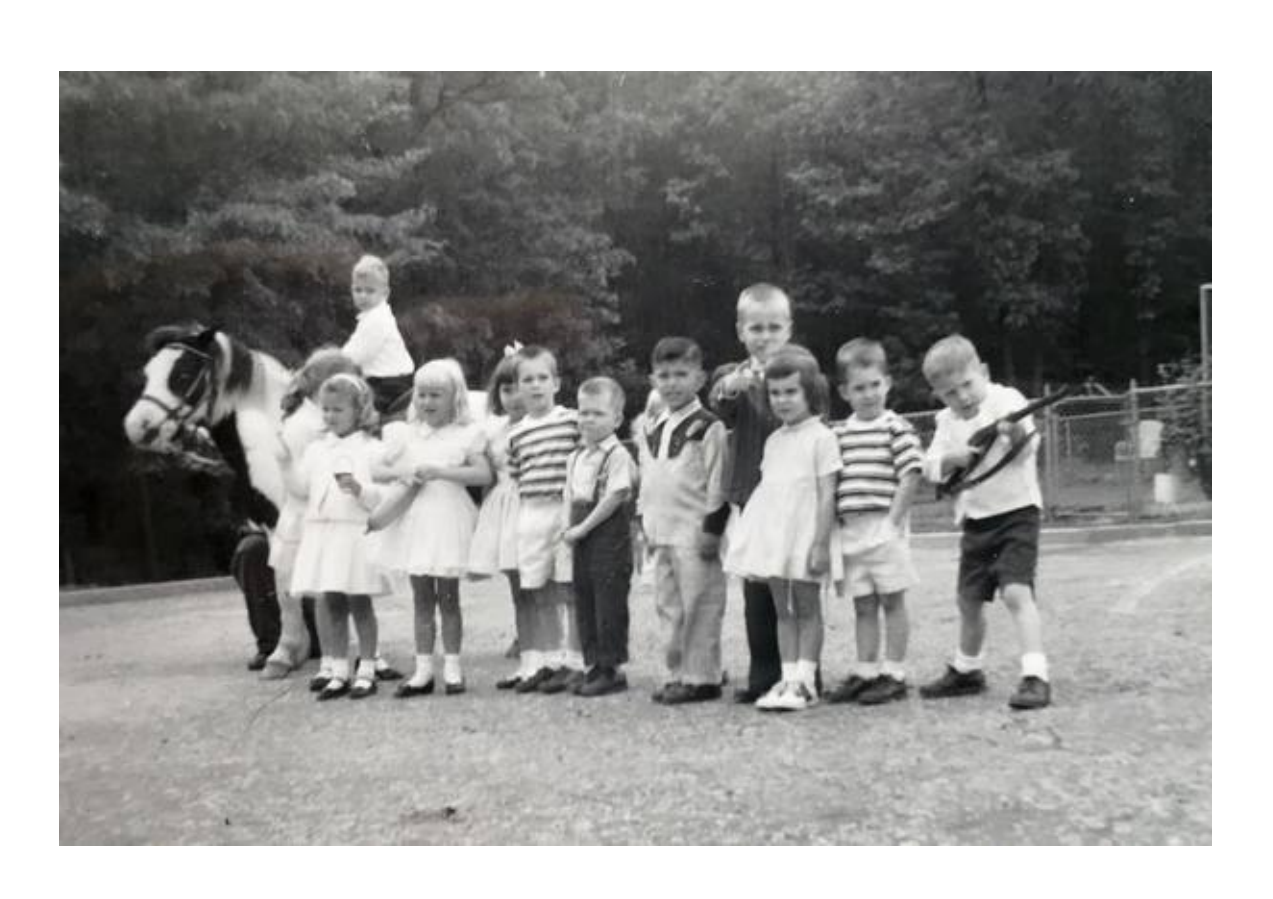
#2. We Got Dressed Up for Birthday Parties. And sometimes there was even a pony there!