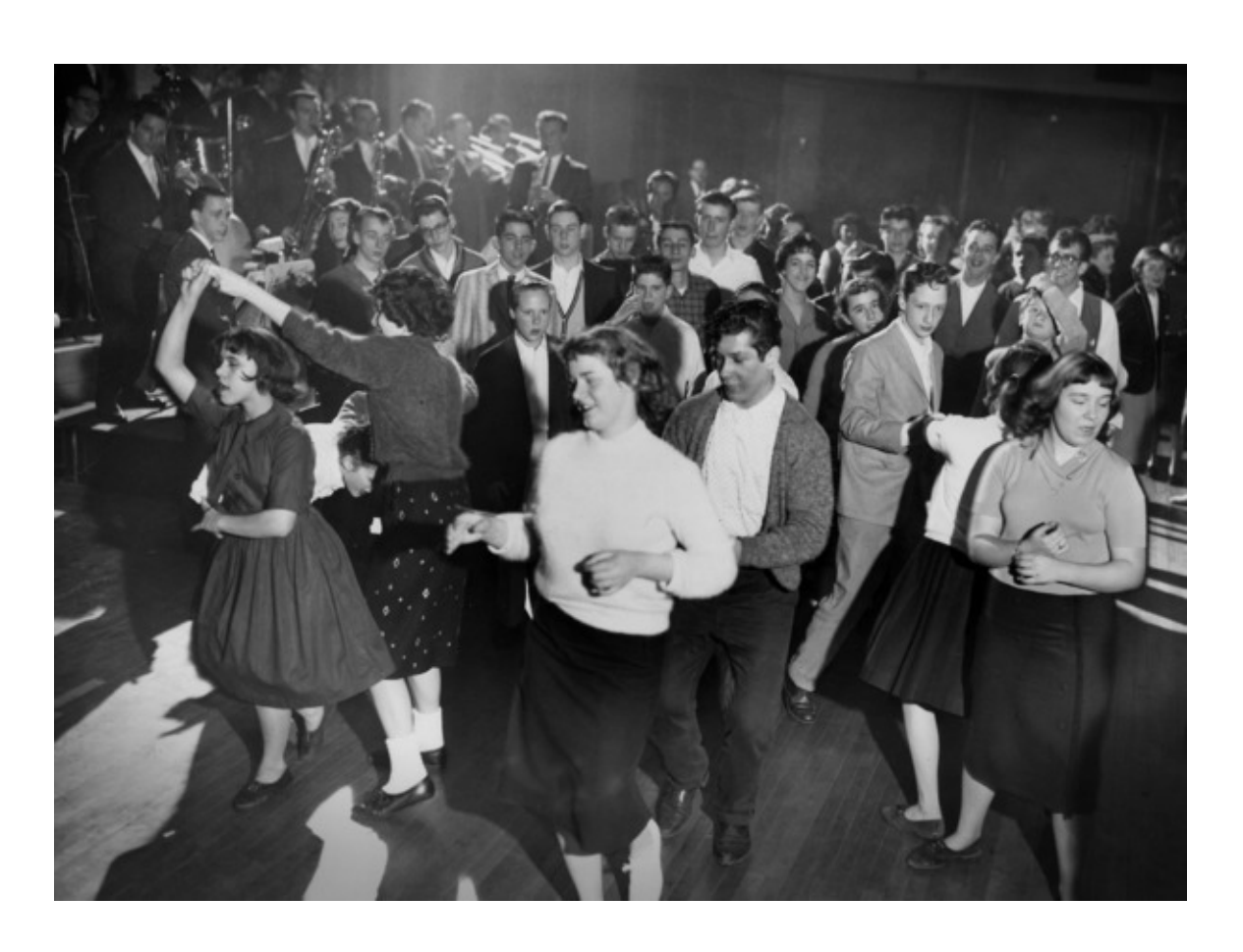
#13: We got DOWN at the Sock Hop!