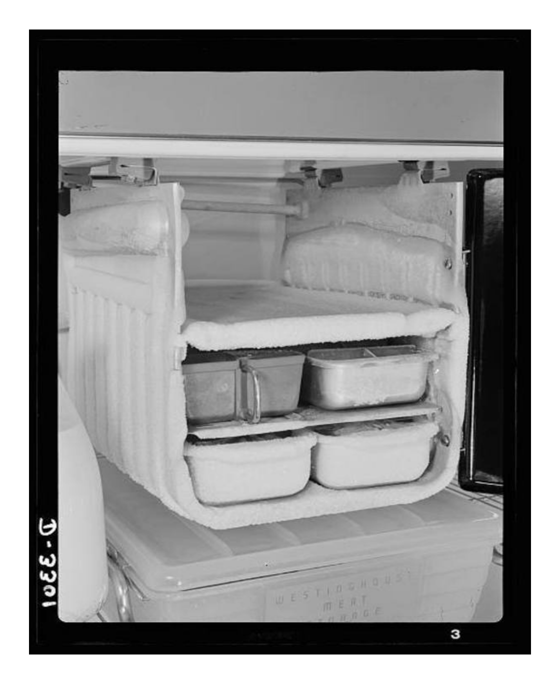
#10: The Freezer Actually Had to be DEFROSTED!: That's right, every now and then you'd have to manually defrost the freezer - sometimes took all day with a lot of scraping!