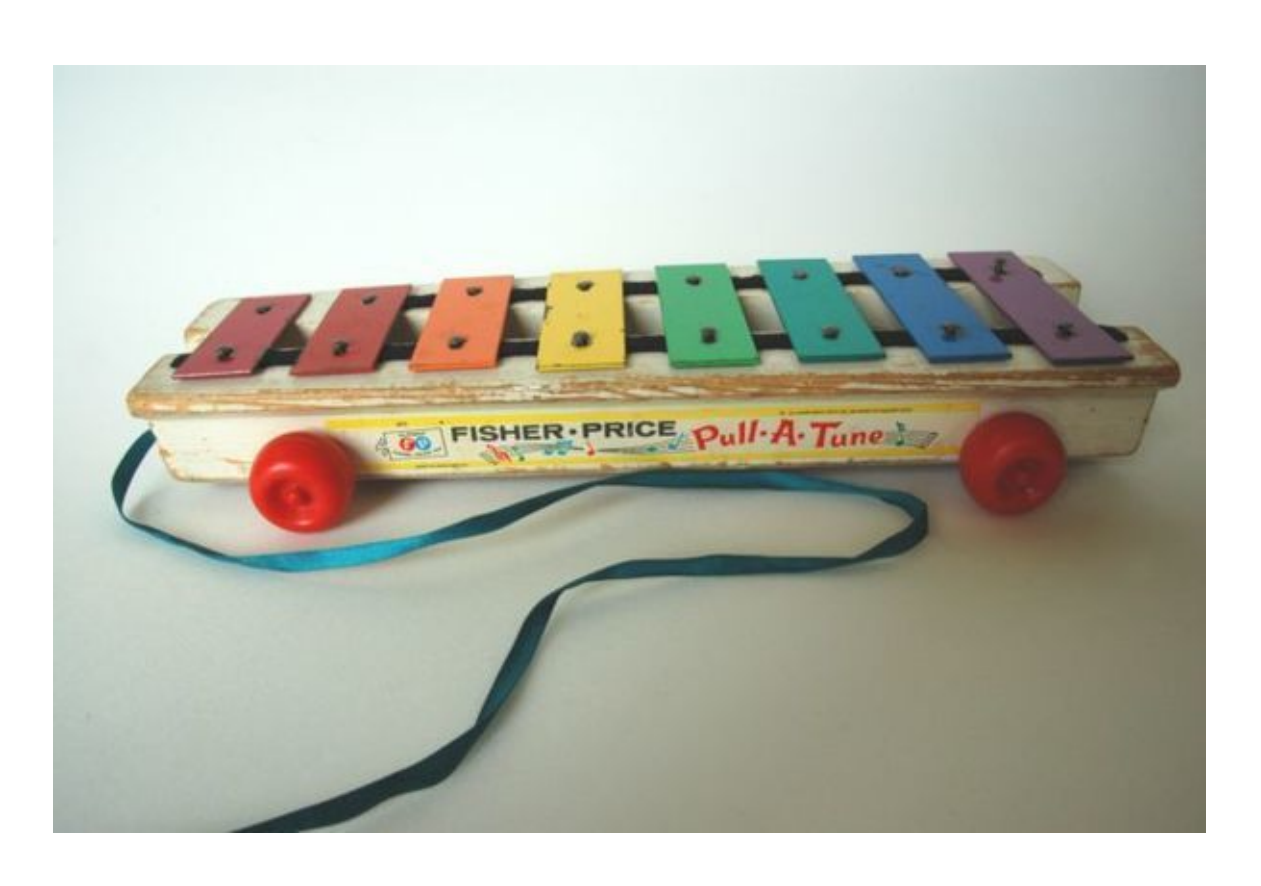
#19: We Had Xylophones That We Kept on a Pull String. That's right - there was nothing like the Pull a Tune!