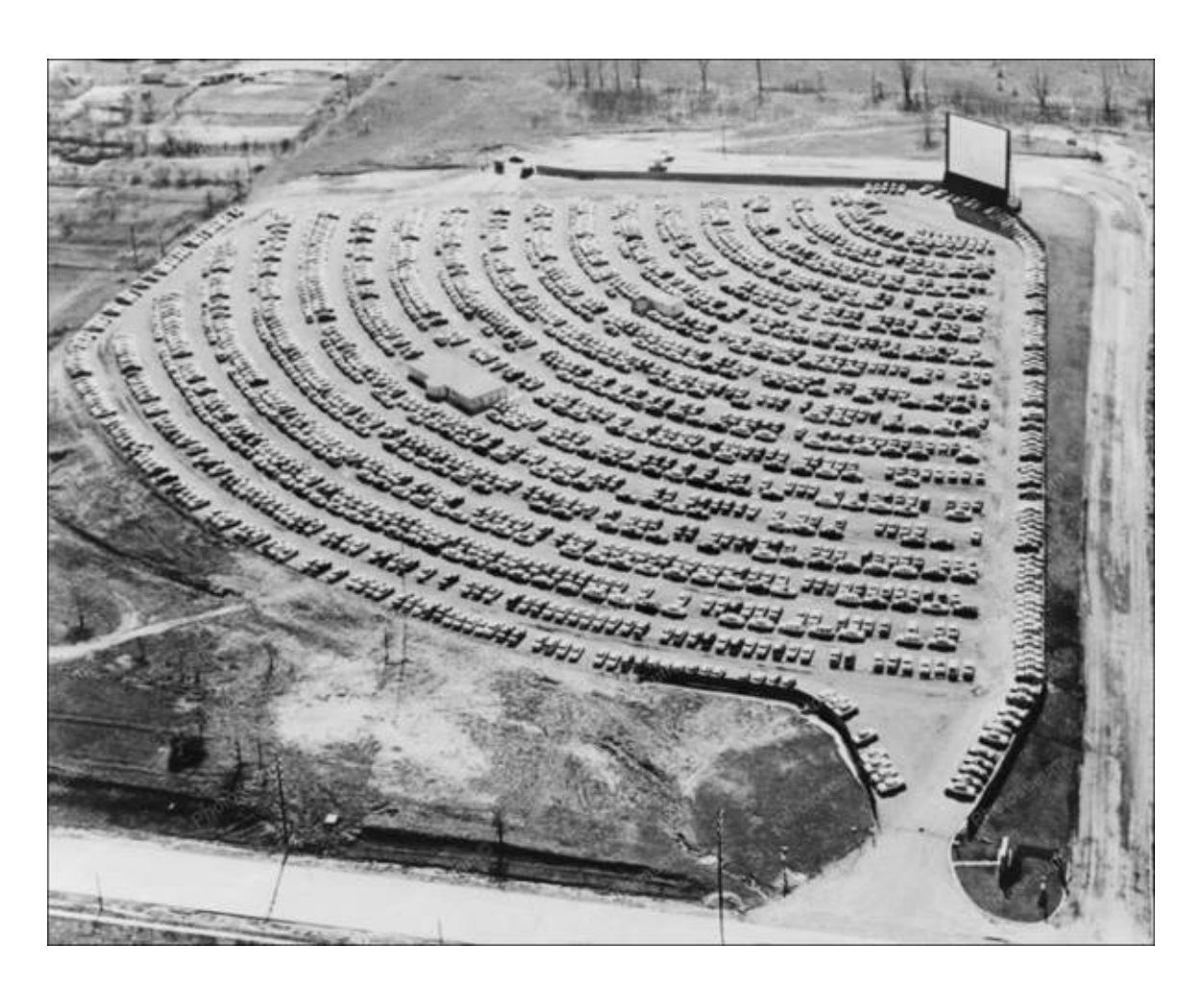
#8: The Drive-In Was The Place to Be: This 1950's photo from South Bend, Indiana shows how popular they were!