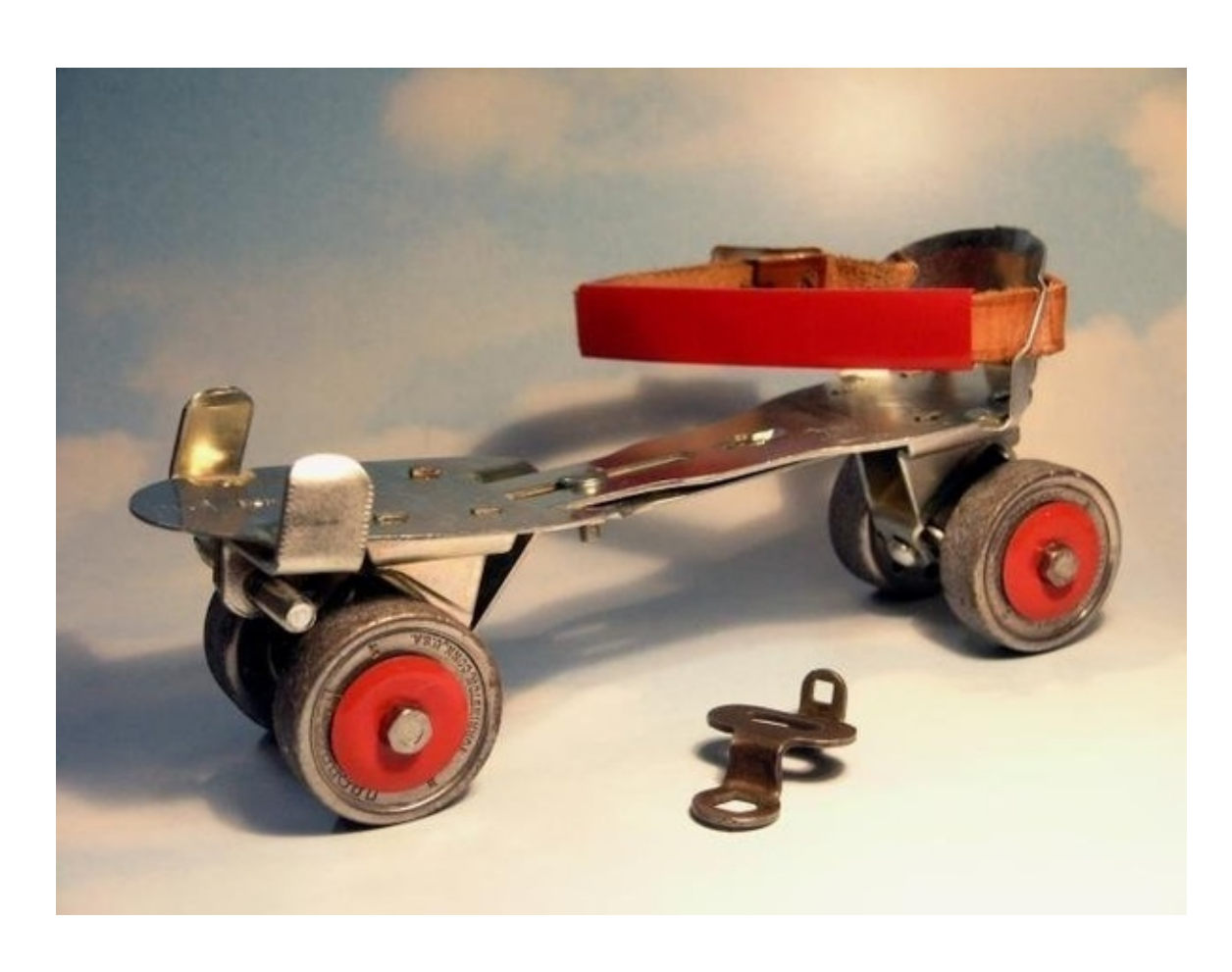
#7: Our Skates Got "Locked" with a Key . They were also made almost entirely of metal and very hard to skate on!