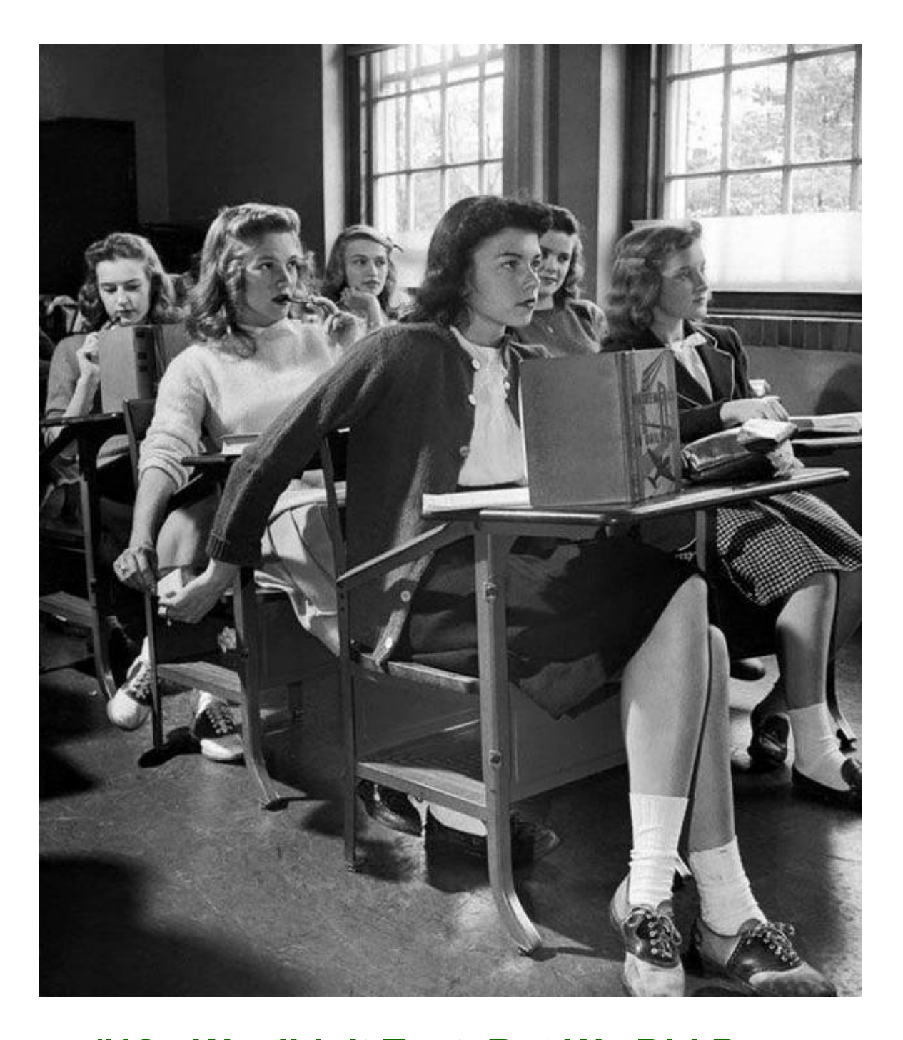
#18: We didn't Text, But We Did Pass Notes! And we were experts at not getting caught!