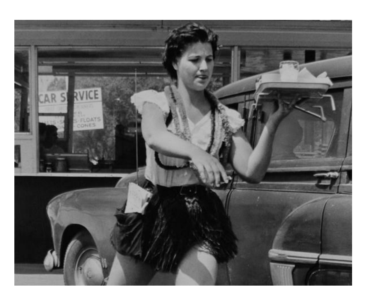
# 12: Sometimes Your Food Came On Roller Skates! That's right - certain restaurants had "roller girls" who would zoom your food out to you!