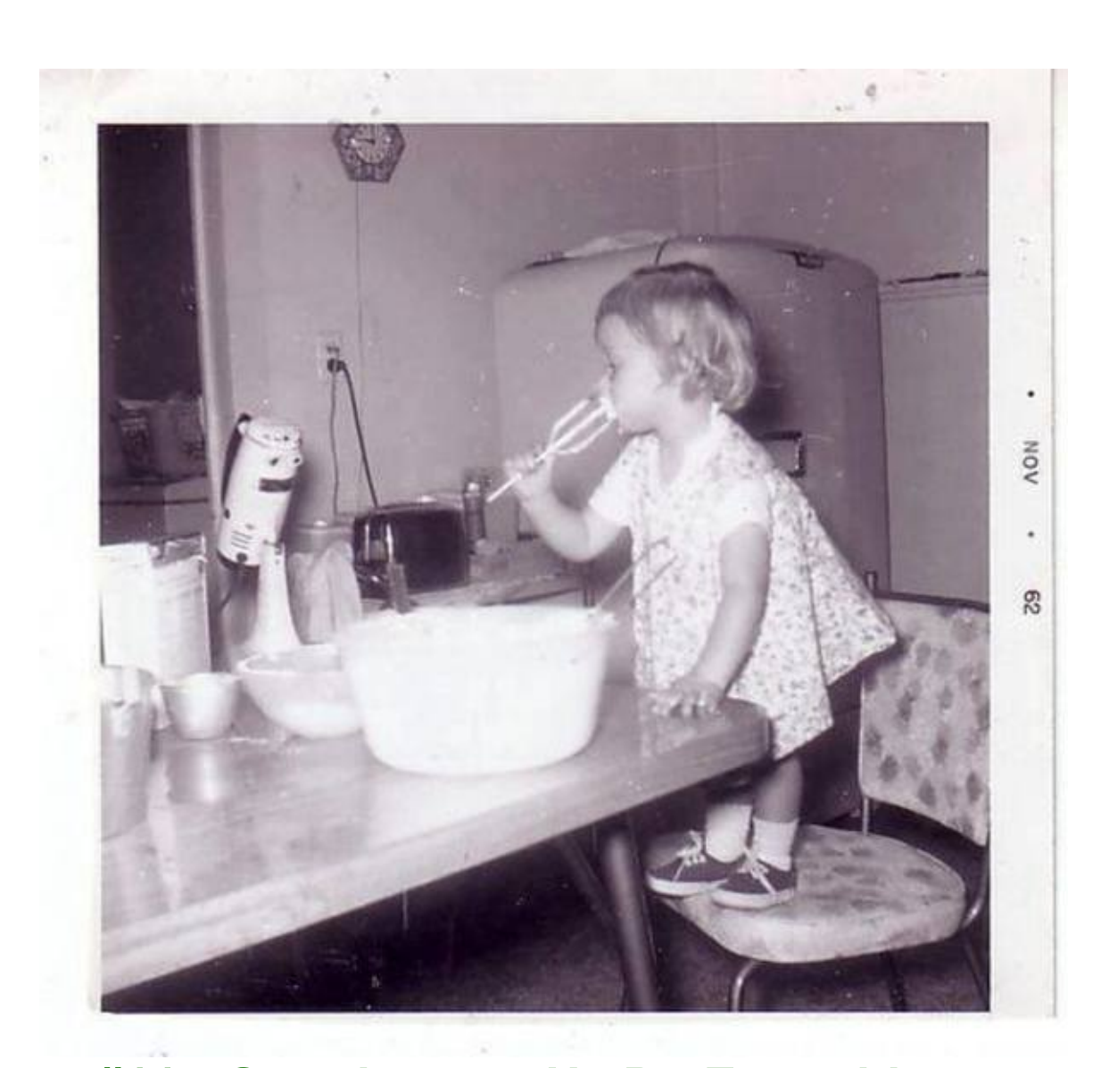
#11: Grandma Let Us Do Everything. Well, maybe that hasn't changed so much, but we LOVED eating off the beaters!