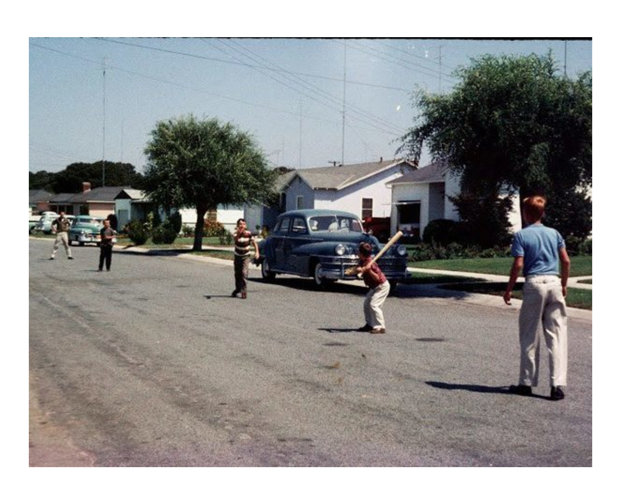
#3: We Played in the Streets: We didn't have to text our friends back in the day - we'd all just come outside and get to playing!