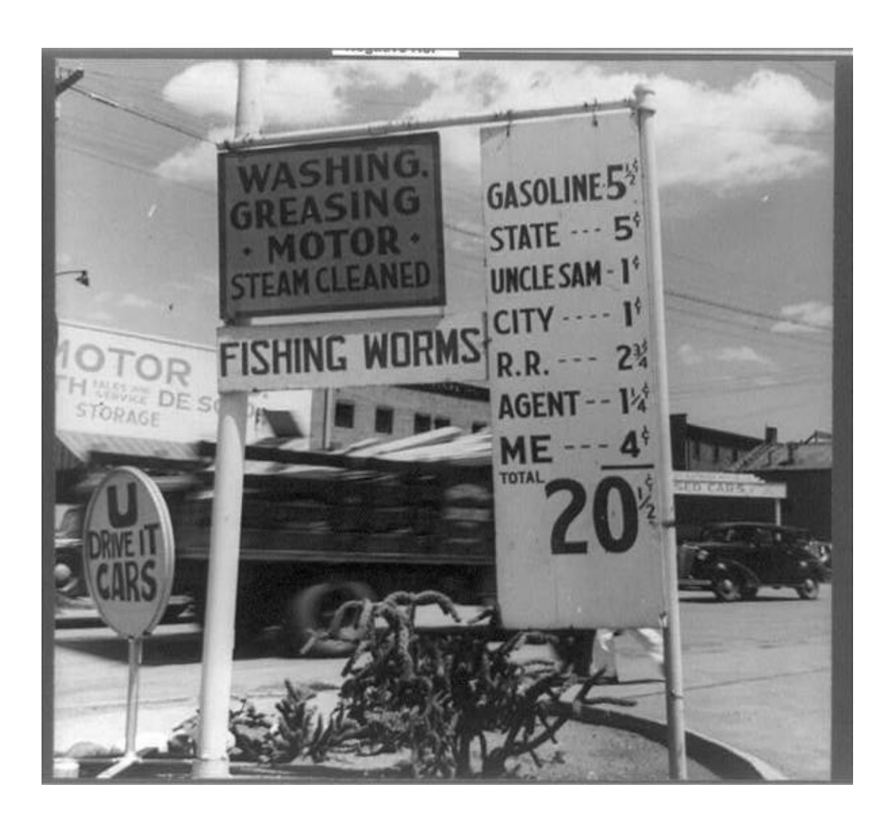
#4: Gas Was Very Cheap: On some days, it was only $0.20 a gallon, and beyond that, the people at the station could also fix just about anything!