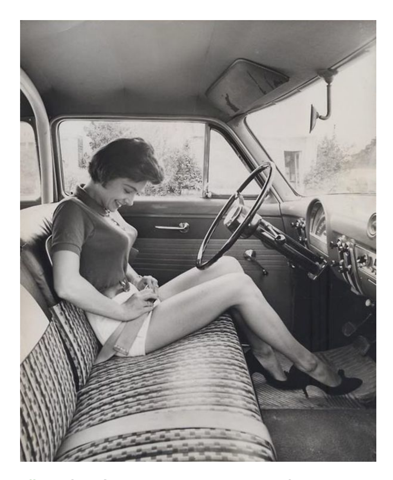
#9: Car Seats Were More Like Couches: That's right - they were big, long, and you could slide all the way across!