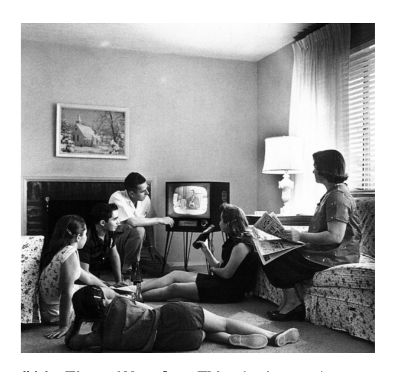
#14: There Was One TV. And, surprise, we didn't argue all night about who should get to watch their favorite show. Most of the time, we all liked the same shows!