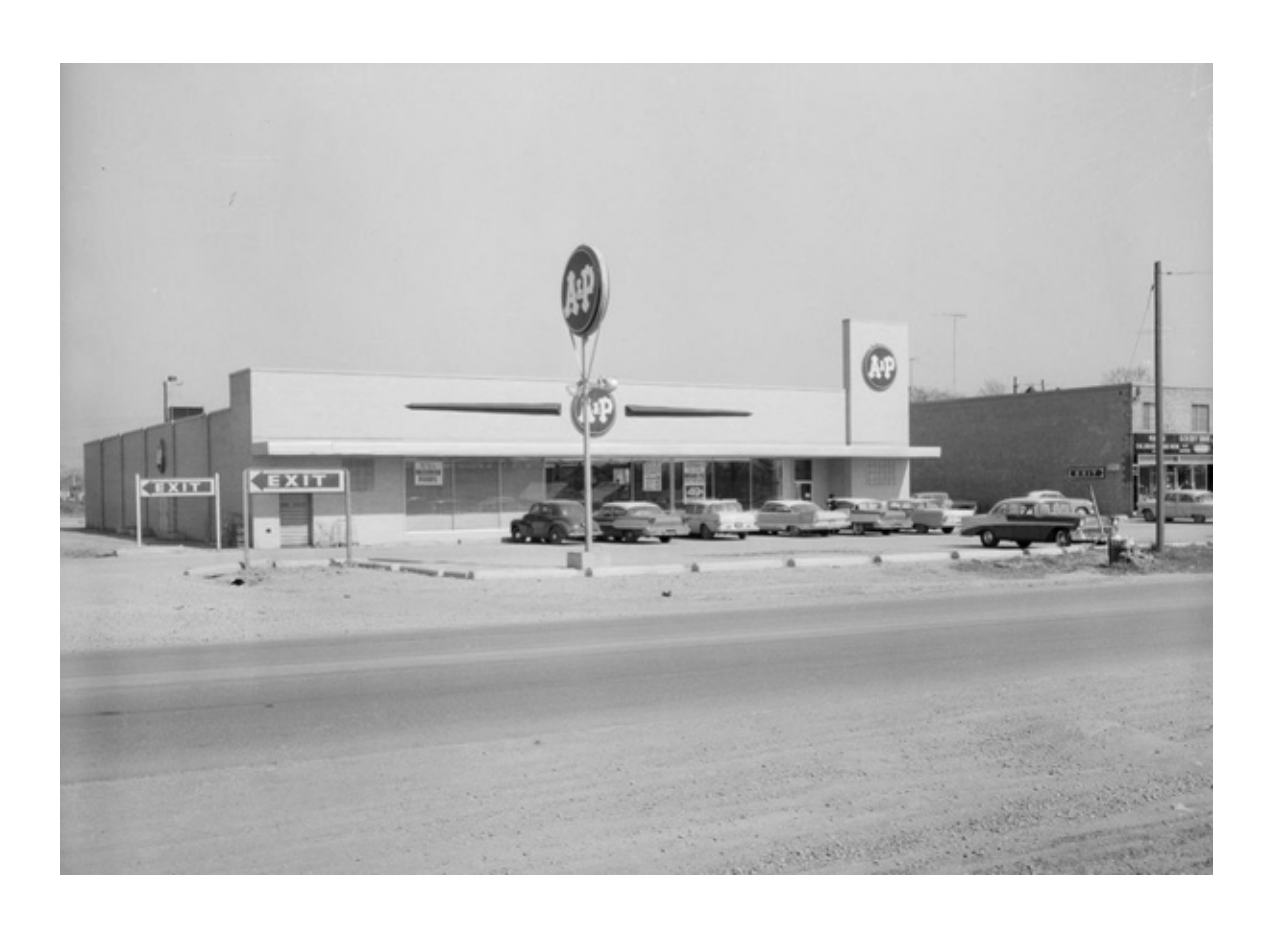
#6: If it Wasn't the Ben Franklin, it Was the A&P!