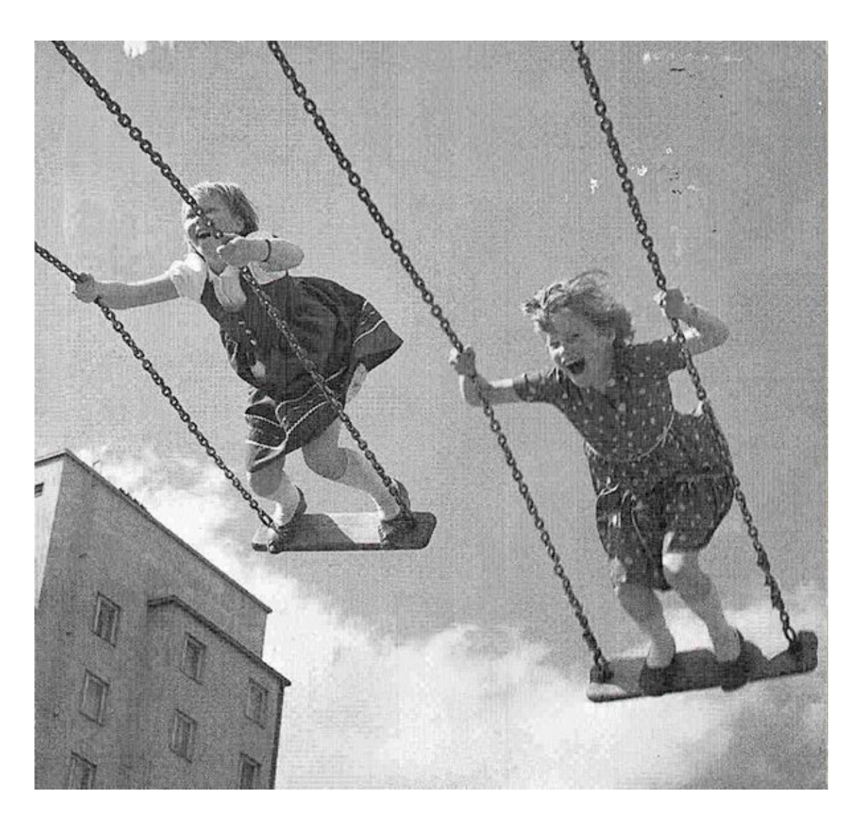
#15: The Playgrounds were VERY Different: At recess, we'd swing from the monkey bars with wild abandon and often even stand on the swings and go as high as possible. And still, we survived!