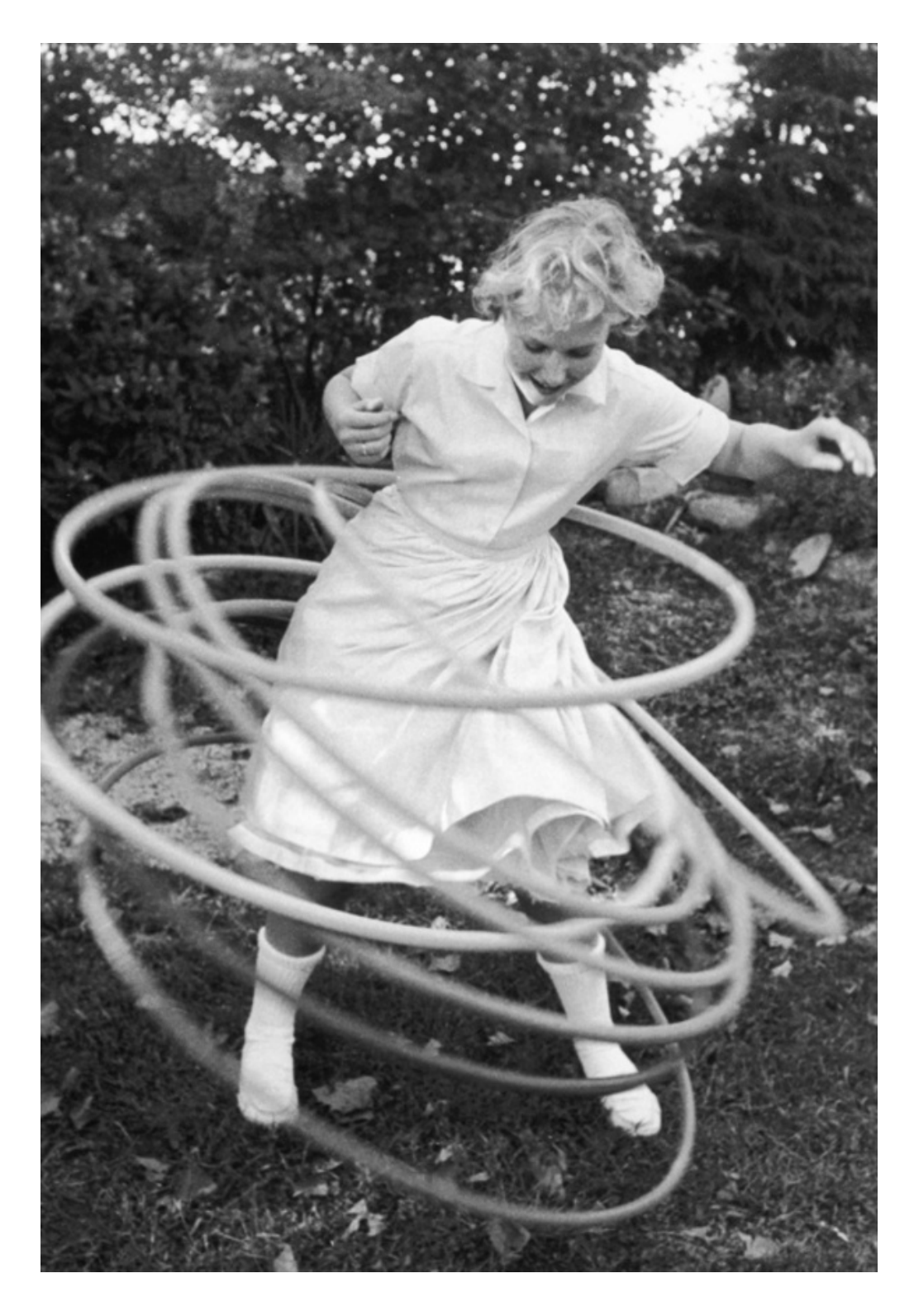
#17: Just One Hula Hoop Wasn't Enough: Some of us could do multiple at a time!